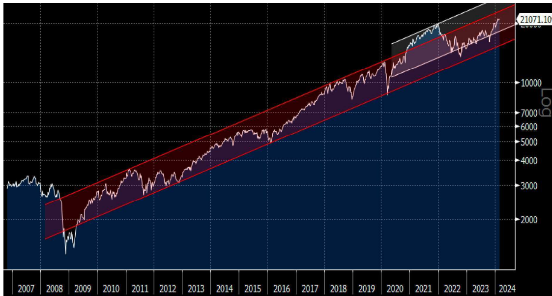
Fig. 7 – S&P Information Technology Index, equal-weighted, log scale

Overall, the trend is holding, as shown in Fig. 7 , above. It looks as though the line is now nearing the top of the trend, but given a log scale and a 15% trend, reaching the top of the trend would require another 25% upside by the end of 2024, so there is plenty of upside.