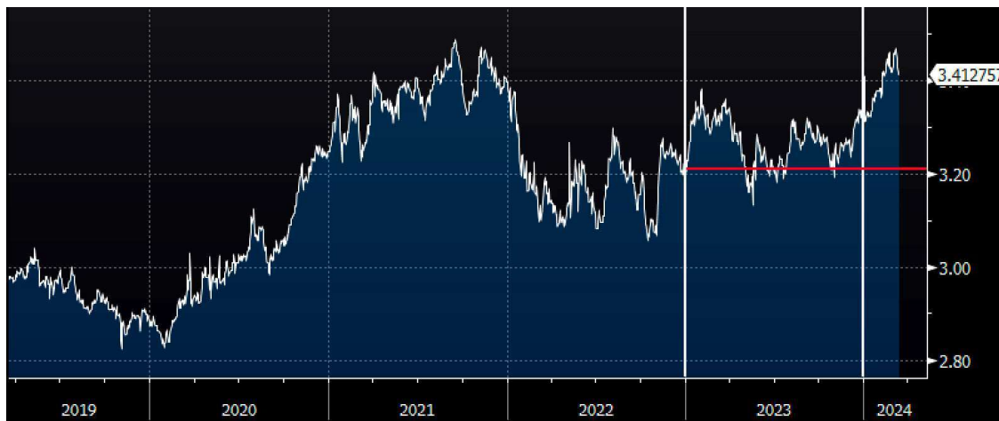
Fig. 2 – BlueBox Global Technology Fund S class vs S&P Global BMI IT Index NTR

In my view, mega-caps dominated performance because the rebound in tech was driven not by institutional money (I am not aware of any professional investors who made significant increases in their tech allocation in 2023 – not one has claimed to have done so, out of the hundreds I have spoken to), but by US retail investors, for whom GenAI is the perfect story. Those individuals move fast and buy what they know, thus favouring the biggest names.