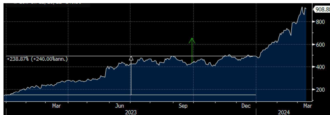
Fig. 4 – NVIDIA stock price

This was because GenAI excitement drove NVIDIA up 239% during the year ( Fig. 4 ), and other perceived enablers were also up very strongly, especially a big portion of the semiconductor and semiconductor capital equipment industry ( Fig. 5 ). NVIDIA is the leading vendor of graphics processors (GPUs), which are the preferred chips for processing vast quantities of data very fast, and hence for training AI systems. NVIDIA's CUDA platform has also become the default for creating AI systems, giving the company a solid lock on the industry, for now.