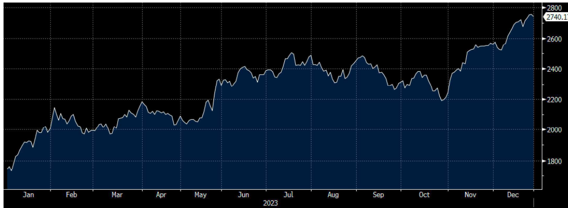
Fig. 1 – BlueBox Global Technology Fund S class – NAV

The Sub-Fund spent most of the year ahead of the benchmark (the red line in Fig. 2 , below), despite the mega-cap headwind through the year ( Fig. 3 , below).