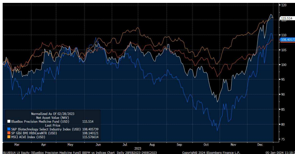
Fig. 1 – The BlueBox Precision Medicine Fund - S Class; S&P BMI Healthcare Index; S&P Select Biotechnology Index and MSCI ACWI World Index from Inception to 29/12/2023 (rebased to 100 at 28/02/2023)

The Sub-Fund also benefited from the enabler group of companies, which had underperformed during the rest of the year, moving upwards during the fourth quarter as business stabilisation and return to growth in 2024 began to be anticipated. This is discussed in more detail below.