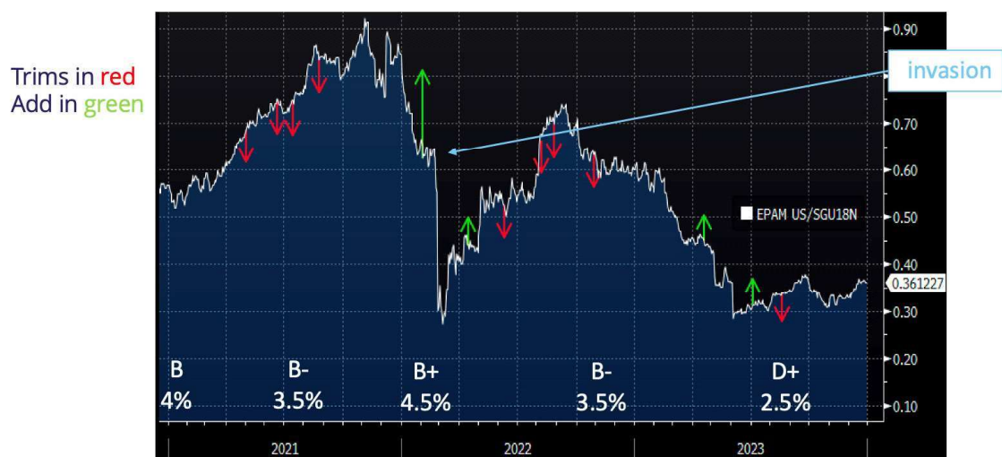
Fig. 6 – EPAM vs S&P Global BMI NTR

As well as selling Fortinet and adding to NVIDIA in September, we also sold Hexagon and bought Amadeus in July. Hexagon was one of the original Direct Connection stocks from back in 2005, but we have felt for a while that the story was probably decelerating for this company and we have brought the position down over time accordingly. We finally sold it and switched into Amadeus, which is an even older play on automation, in this case of the air travel booking system, but which now has about 70% share (generally a very profitable position in much of tech) and is extending its reach into other areas of travel booking, giving scope for further earnings growth.